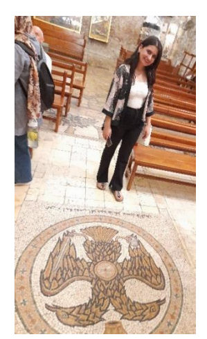
On Day 2 (September 6, 2022), Dignilogues No.3 and 4 were on the agenda.

The second and third days of the conference were held at the RIIFS building. HRH Prince El Hassan bin Talal and his cousin, HRH Prince Firas bin Ra'ad (a member of the World Bank) also attended.