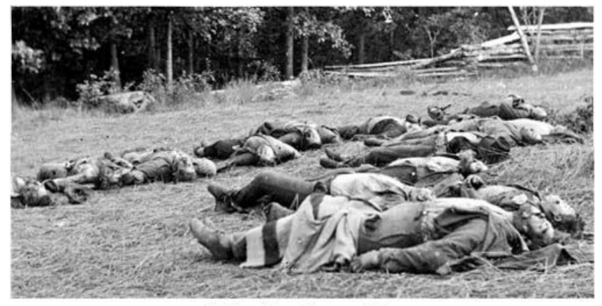
Civil War Casualties