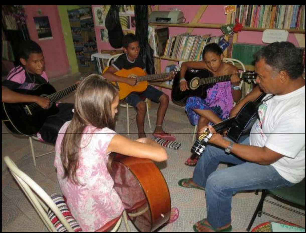
And we cultivate ourselves as artists and producers of the future in anticipation of the tsunami of consumerism