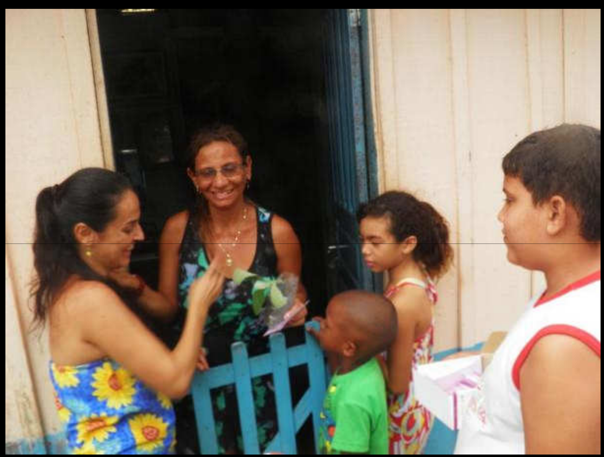
We act as creators, producers and artists on the decisive threshold between the intimate and public stages