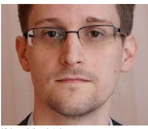
High-resolution photo her

"Chelsea Manning ... The leaked documents pointed to a long history of corruption, serious war crimes, and a lack of respect for the sovereignty of other democratic nations by the United States government in international dealings. .... The revelations she helped disclose have fueled democratic uprisings around the world, including a democratic revolution in Tunisia. According to journalistic, academic, and intellectual scrutiny her actions helped motivate the democratic Arab Spring movements, shed light on secret corporate influence on foreign and domestic policies of European nations, and, also contributed to the Obama Administration's agreement to withdraw all U.S. troops from occupied Iraq. ....The profound information that was revealed by this courageous whistleblower helped to foster public dialogue on the legitimacy, suitability, and relevancy of the military interventions carried out by US troops both in Iraq and Afghanistan. [and] led directly to calls demanding the full withdrawal of the military forces from these countries, as well as investigating committees on the treatment of detainees in the Guantanamo Bay detention camp."