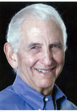
High-resolution photo here

"Has won recognition as the «grand old man» among whistleblowers"